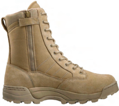
SHOT Show Special #1 Composite Toe Tan Side Zip, Style 1260

PROMO CODE: 1260SHOT Wholesale: $49.50 SHOT SHOW: $44.50 12 Pair Minimum Terms: 3% 60 Net 61 Expires: 2/28/07