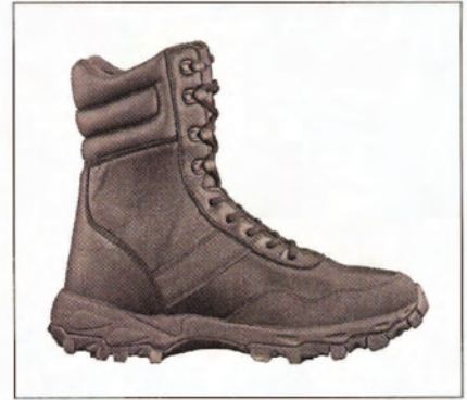
Original S.W.A.T. Footwear Co.

The SEK 9000 Boot by Original S.W.A.T. is a lightweight (43 ounces/pair) tactical boot built for stealth maneuvers in a full range of environments and situations. Built on a genuine VIBRAM outsole, the boot features an aggressive, multi-terrain tread with a cushioning EVA midsole. The outsole has built-in arch reinforcements for rope rappelling and added foot protection. The EVA midsole is topped by a lightweight, riveted steel shank sandwiched between two flexible lasting boards for superior lateral stability, torsional strength and additional under-arch protection. For added comfort, the removable molded orthotic footbeds are designed with gel inserts at the heel and forefoot.