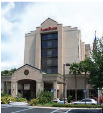
Hyatt Place (formerly Amerisuites) 8741 Intl. Drive, Orlando (407) 370-4721

If you don't know this by now, you are lost. The Original SWAT Sales meeting will be held at Hyatt Place / Amerisuites on January 11, 2007, beginning at 5:30 pm.