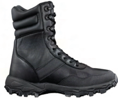
SHOT Show Special #3 SEK 9000 Style 9000G

PROMO CODE: 1262SHOT Wholesale: $47.50 SHOT SHOW: $42.50 12 Pair Minimum Terms: 3% 60 Net 61 Expires: 2/28/07