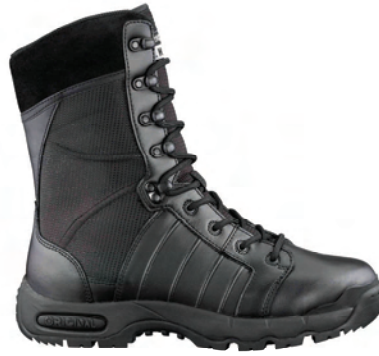
SHOT Show Special #2 Classic 10" MTO Style 1262

Introducing three new SHOT Show Specials for your USA retailers to take advantage of. Program sheets/Order forms are available at the Original S.W.A.T. trade show booth, or contact your O-SWAT customer service representative, Shawnta.