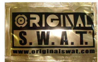
New Promo Item! OSWAT Hand Sanitizer #CLEANHANDS